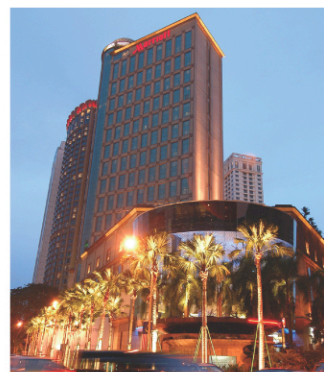
JW Marriott Hotel Appraised value of property RM 329 million