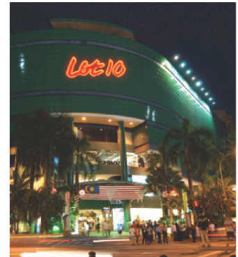
Lot 10 Shopping Centre Appraised value of property RM 341 million

Tenants at the Lot 10 Property include Esprit De Corp, Isetan of Japan, The Hour Glass, Topman Topshop, Timberland, House of Woo Hing and Guess.